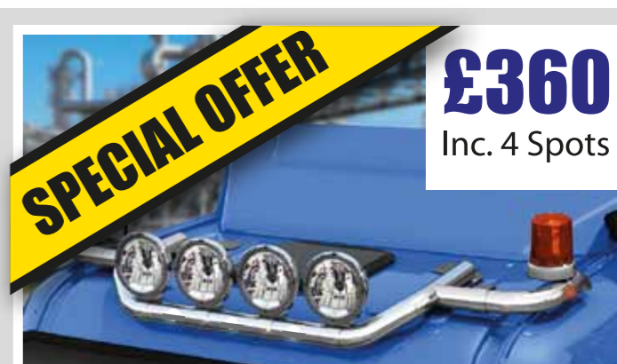
Volvo FH 2008> Top Light Bar