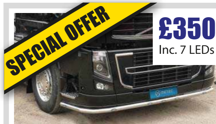
Volvo FH 2008> Under Bumper LED Bar