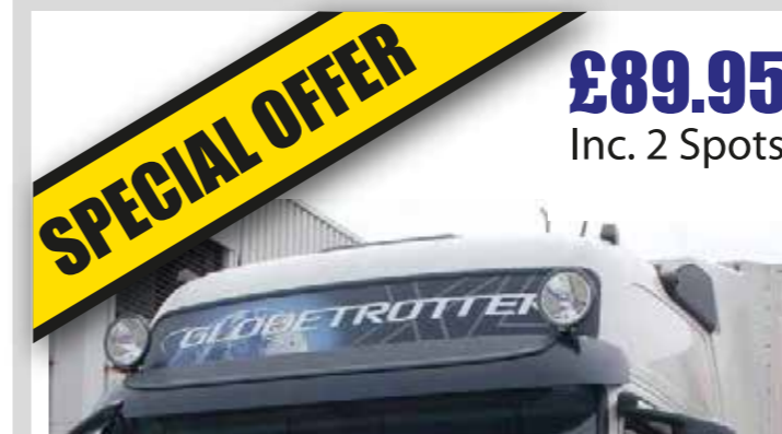
Sun Visor light kit suitable for the Volvo FH 3