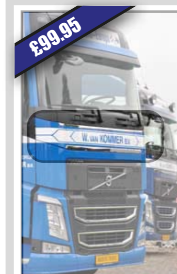
EXCLUSIVE Front name board for the NEW FH 4