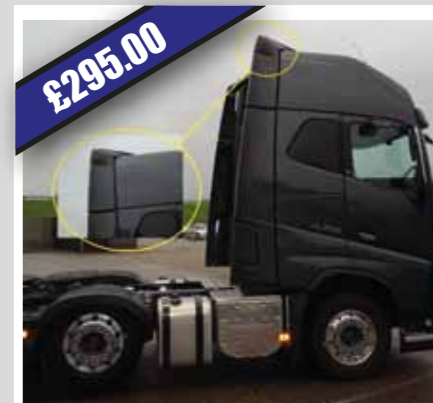
NEW! Top corner ear in-fills suitable for the NEW FH4 with factory fitted blade.